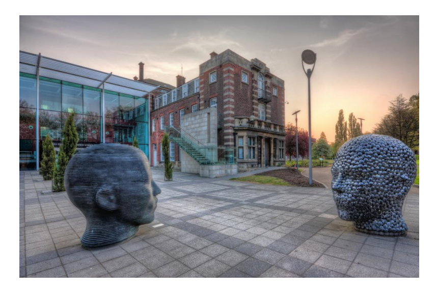
Hull University Sculptures

Overall, we were trying to find out whether it was worth doing a much larger study. Large studies are expensive and take a long time. It is therefore important to know if a bigger study is worthwhile and likely to be completed successfully.